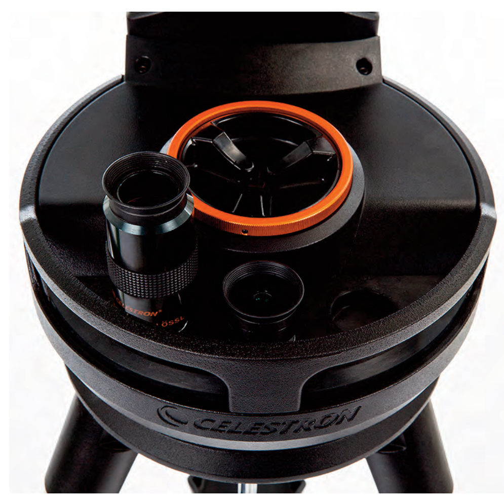
Image 4 - More eyepieces spaces are integrated into the Evolution 6 drive base.

ience, optical performance, and portability.