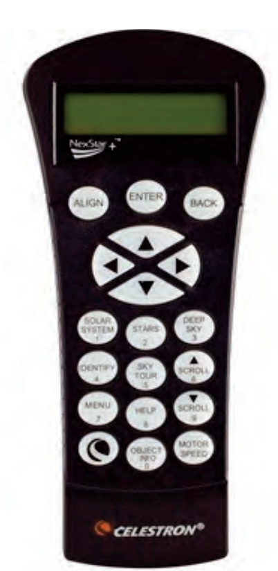
Image 8 - Celestron NexStar+ Hand Control.

with its collimation being spot-on. No adjustments were necessary.