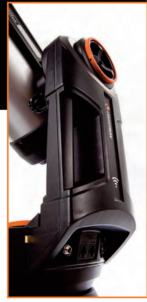
Image 1- The Evolution 6 features a newly designed single-arm architecture.

In April, 2014, I was working at a vendor booth at the annual springtime ritual that is the NorthEast Astronomy Forum, commonly known as NEAF. As such, I was an invitee to an exclusive Celestron reception of the new product introduction for the Celestron NexStar Evolution telescopes, and a new 11-inch Rowe-Ackermann Astrograph.