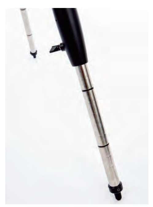
Image 2 - Gradations are imprinted into the tripod's extendable legs to aid in leveling the mount at a repeatable height.

telephone-like coiled controller cable. The Celestron NexStar Evolution 6 utilizes a revolutionary cordless WiFi interface with the user's tablet or smartphone to control the telescope. The user's iPhone, iPad, or Android tablet or phone loaded with Celestron's free SkyPortal application, a special version of the Sky Safari 4 Basic application, is used to control the Evolution telescope. SkyPortal also contains a database of information, including Celestron Audio that provides descriptions and histories of many stars, nebulae, clusters, planets, and galaxies. Additionally, a standard Nexstar+ hand controller is included with each Evolution telescope to provide an alternative means of controlling the telescope.